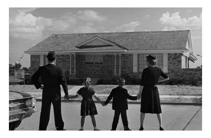
Figure 4. Designing normativity.

Sociologist of social movements, Joyce Bell, describes courtrooms as "white hegemonic space." Writing about tactics that black liberation activists used in courtrooms in the late 1960s, Bell describes courtroom architecture as part of a racist justice system. Black activists on trial used their bodies--their appearance, location, and movement--as political tactics to counter the courtroom's racializing strategies. Those strategies, expressed in architecture, leveraged hierarchy and power inequality, symbolism through portraiture of white justices, and the placement of disciplining bodies in strategic locations in the room. "The courtroom—operating as hegemonic white space—was a site of contestation by Black Power activists who found ways to challenge the legal, ideological, and physical space of the courtroom." Purportedly just and equitable, the architecture of the courtroom reflects colorblind racism's ability to maintain a racial order. The contrast between the colorblind architecture of the courtroom and the overtly racist architecture of the prison (Figure 2) indicates how design figures in white hegemony.