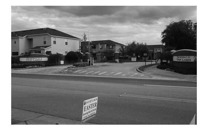
Figure 5. Twin Lakes Community, Sanford, FA.