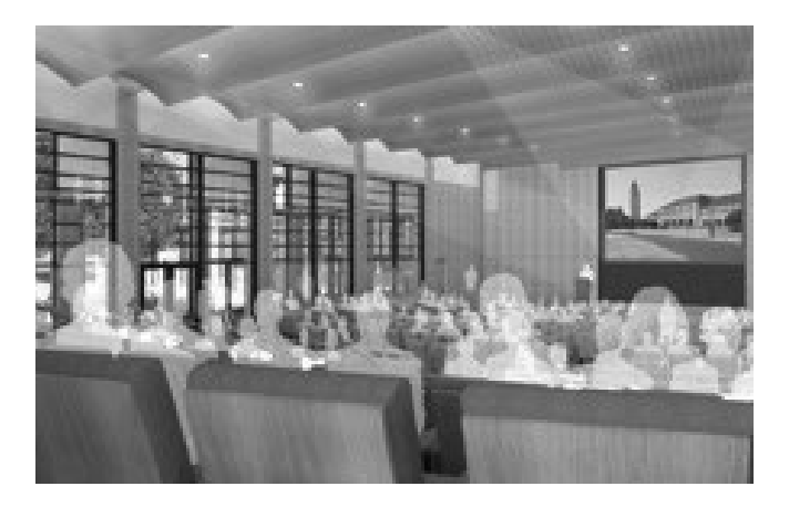
Figure 3. White hegemonic space. (Source: rendering of the Everett and Jane Hauck Auditorium of the Hoover Institution at Stanford University, CA, https://www.hoover.org/events/century-ideas-tax-and-monetary-reform-ideas-actions-over-one-hundred-years)

Until we accept this premise, we perpetuate a hegemonic racism.